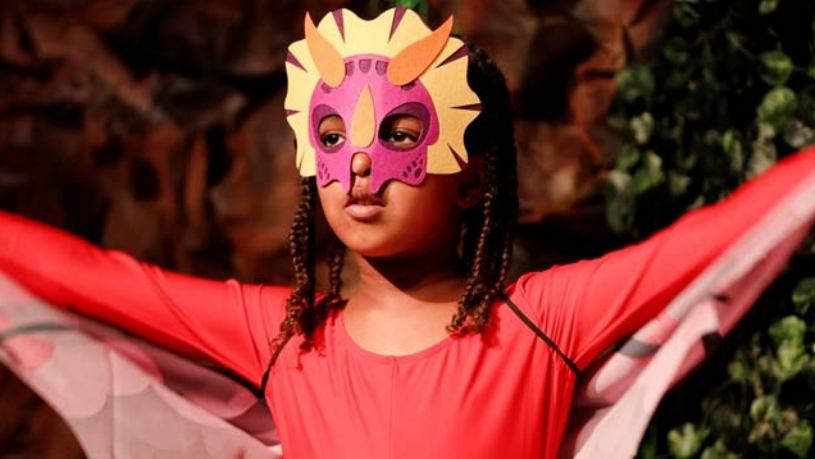
Kindergarten - The Reluctant Dragon