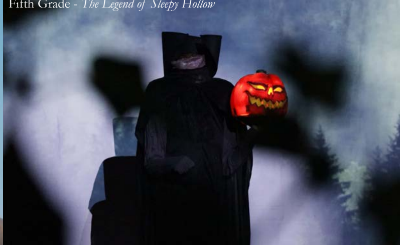
Fifth Grade - The Legend of Sleepy Hollow