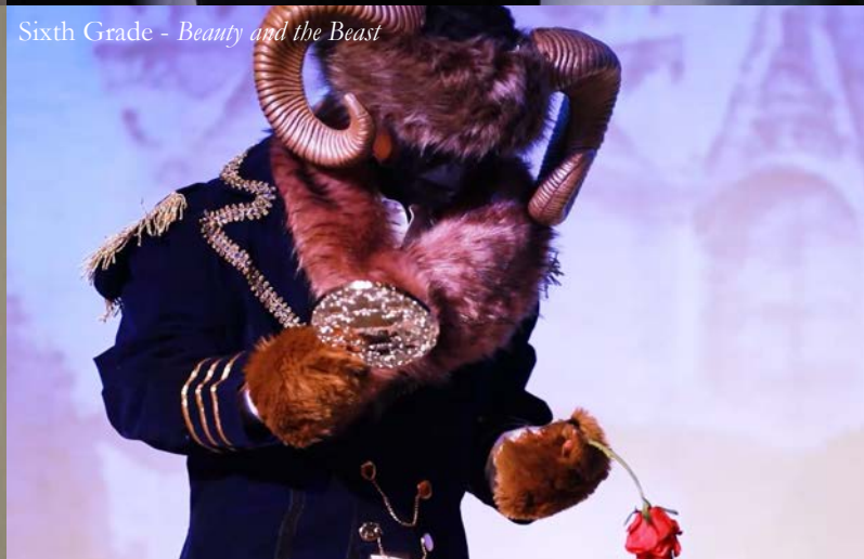
Sixth Grade - Beauty and the Beast