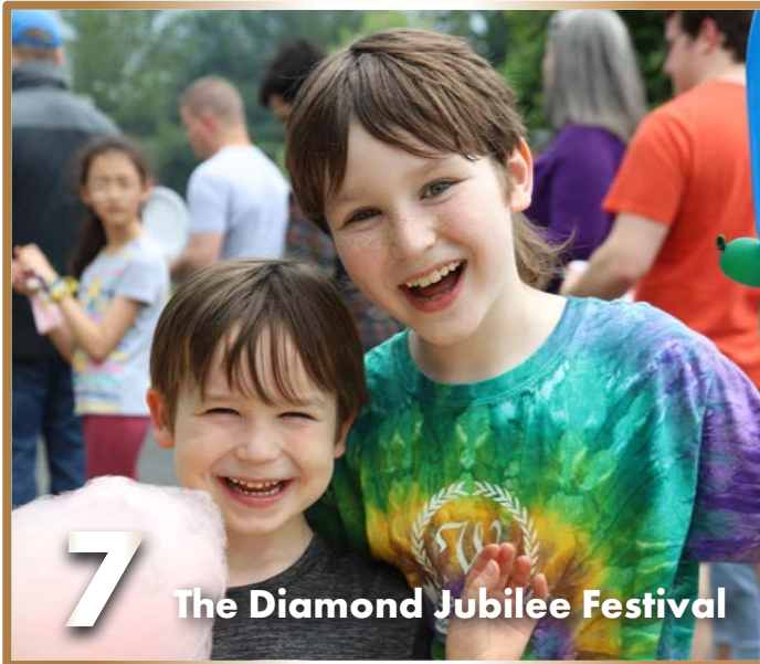
The Diamond Jubilee Festival