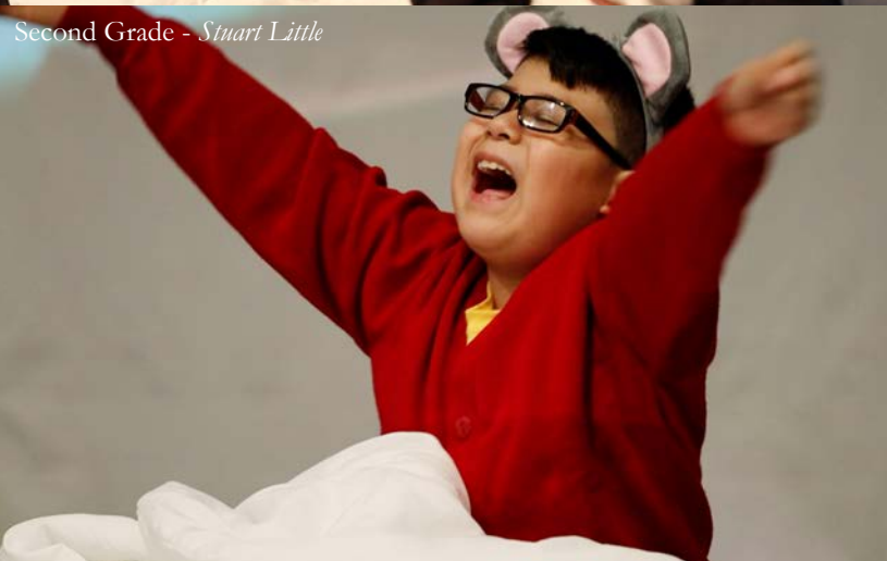
Second Grade - Stuart Little