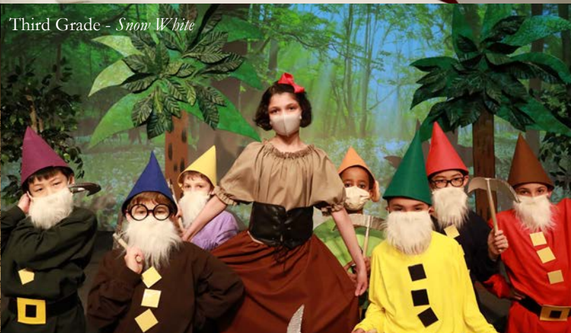
Third Grade - Snow White