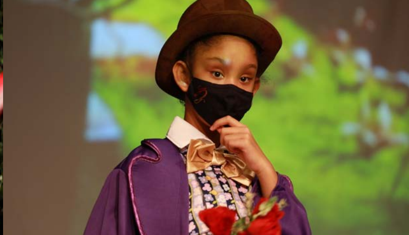
Fourth Grade - Charlie and the Chocolate Factory