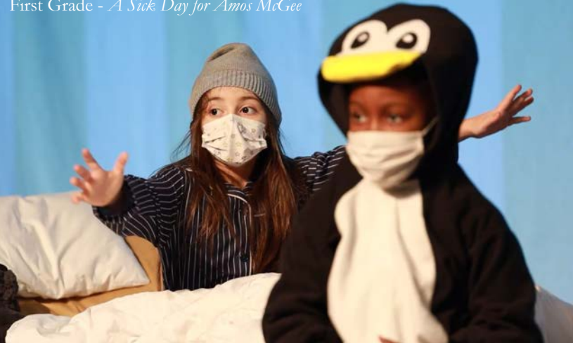
First Grade - A Sick Day for Amos McGee