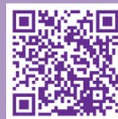
Class of 2022 - The Sound of Music

Subscribe to our YouTube channel and watch any of these performances by scanning this QR code.