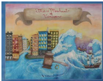
The Merchant of Venice Sophie Le